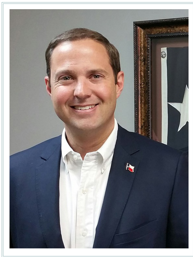
THE HONORABLE DUSTIN BURROWS Texas House of Representatives